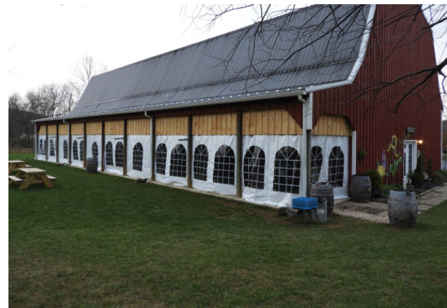
Winery Barn Space