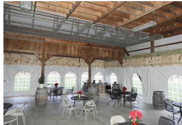
Patio Barn Space Prior to Installation