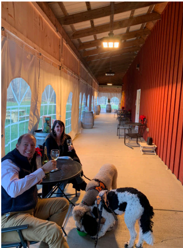
Patrons Comfortably Enjoying a Bottle of Wine