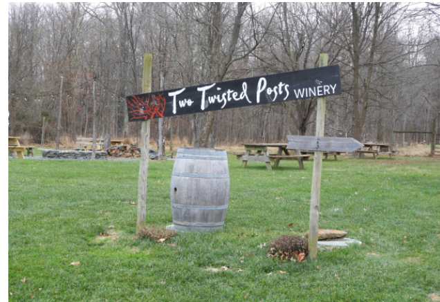
Two Twisted Pots Winery

From the original engineering diagram and with the size, spacing and location of the heaters, the installation was projected to increase the temperature of the large space to within 20 degrees of the outside temperature. In the outside space next to the building, it was projected to increase by 10 degrees. In addition, heating costs were projected to be much lower than using propane to heat the same areas.