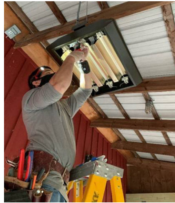
Installation of Marley Infrared Heaters

On one check date with a temperature outside of 32 degrees, the reading in the heated covered area was around 58 degrees. On another date when the outside temperature was 40 degrees, covered area readings were 60 degrees. With the heaters installed, the outdoor areas are much more comfortable for visitors and utilizing these spaces has increased revenue for the owner.