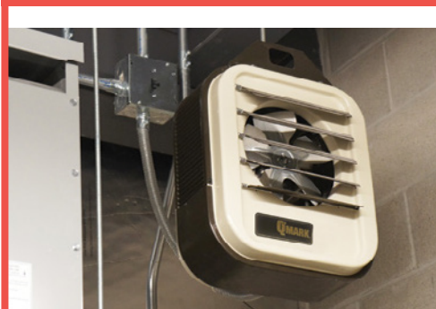
MUH & MUH-PRO