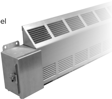
NEMA 4x Model Stainless Steel

* Add suffix for the appropriate color code (i.e. W for white, B for black, etc.).