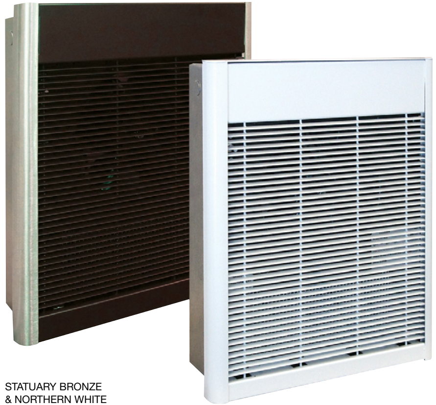
STATUARY BRONZE & NORTHERN WHITE