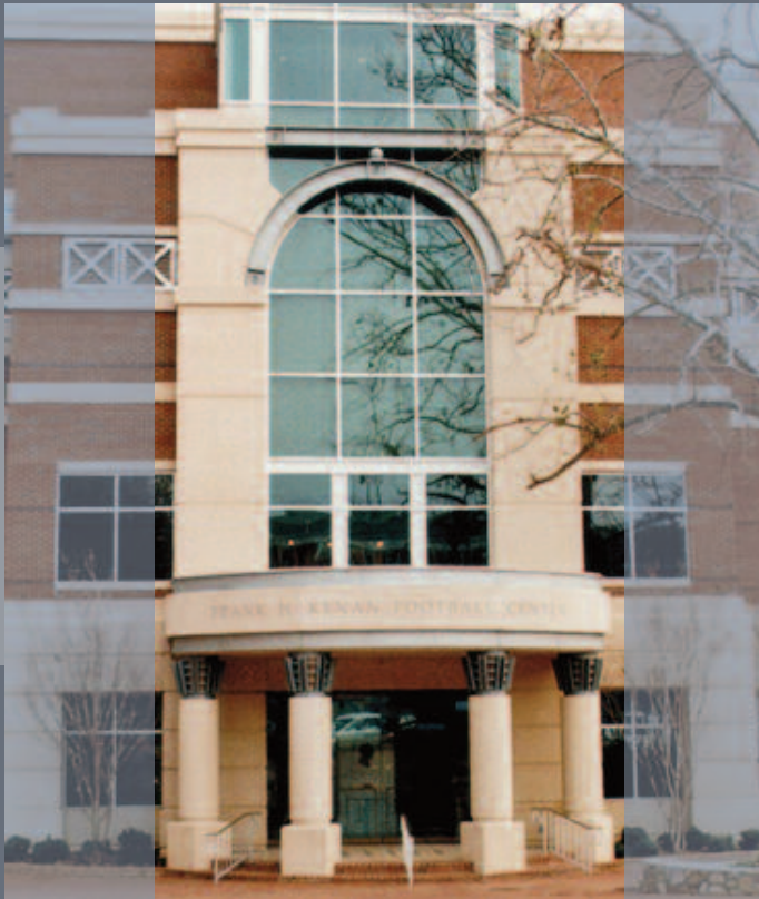
Keenan Stadium, UNC - Chapel Hill, NC Radiant ceiling panels and infrared radiant heaters installed in the overhanging areas of outdoor seating.